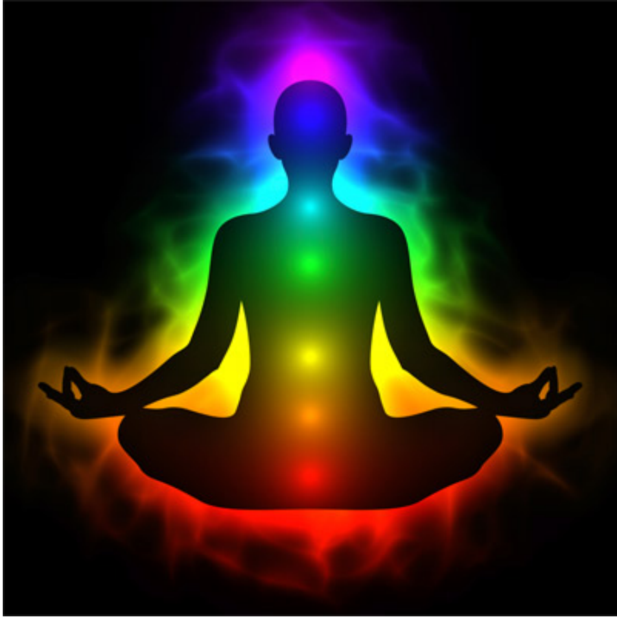
Saadhaka (Spiritual Seeker)